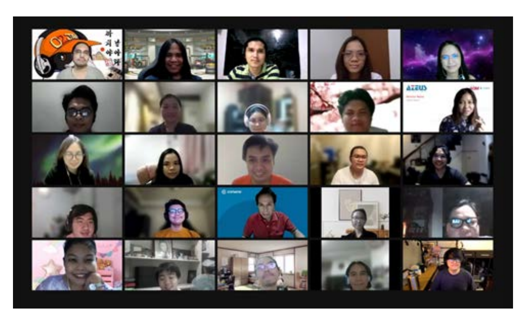
eDice Game staff activity held last September 2021

Employee engagement events or activities are mainly online, to minimize group gatherings. We held multiple virtual team building activities such as the eDice game, online Christmas Celebration Party in the Philippines. During the year, we've also organized eSportsfest and online Trick or Treat during the Halloween, to foster closer working relationships between the employees and the management team.