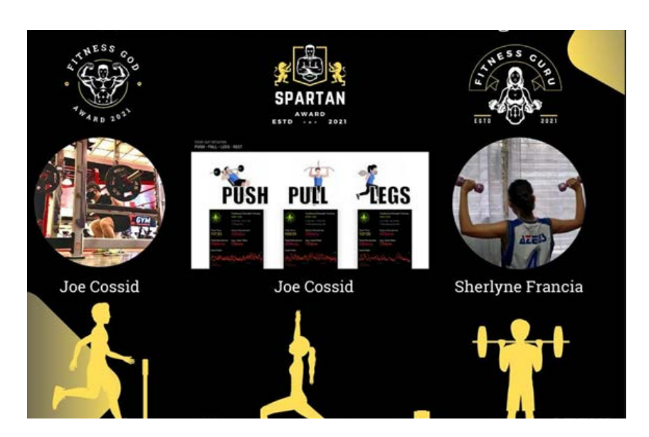
Spartan Award Sports activity held during the year